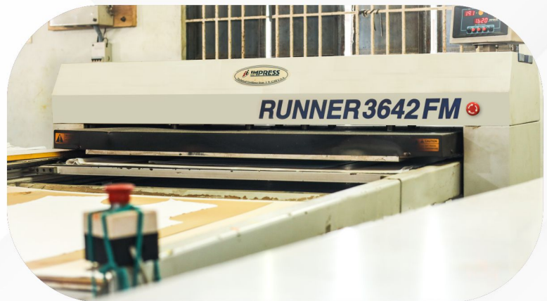
Sublimation Bed Fushing Machine