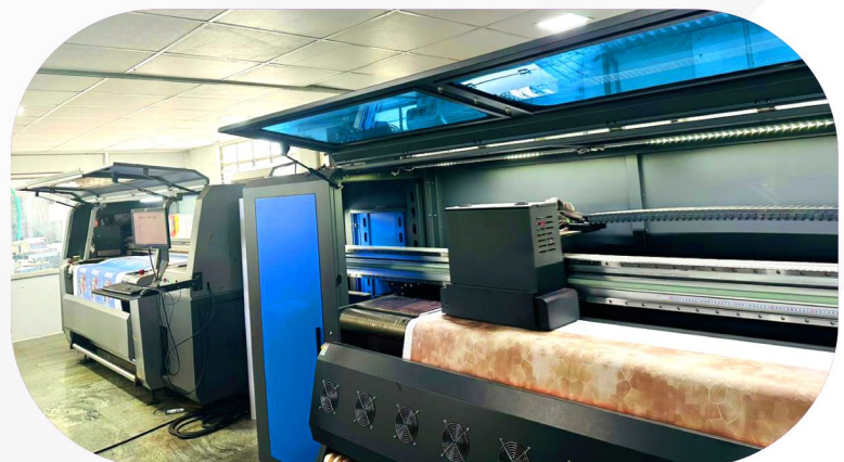
Accuracy Printing With (kyocera) Industrial Head