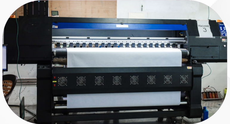
Sublimation Print Machine